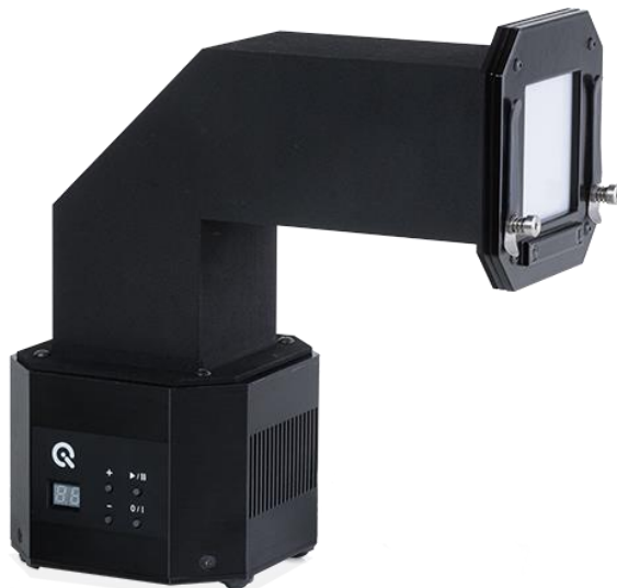
Image Engineering GmbH & Co. KG · Im Gleisdreieck 5 · 50169 Kerpen · Germany

T +49 2273 99991-0 · F +49 2273 99991-10 · www.image-engineering.com