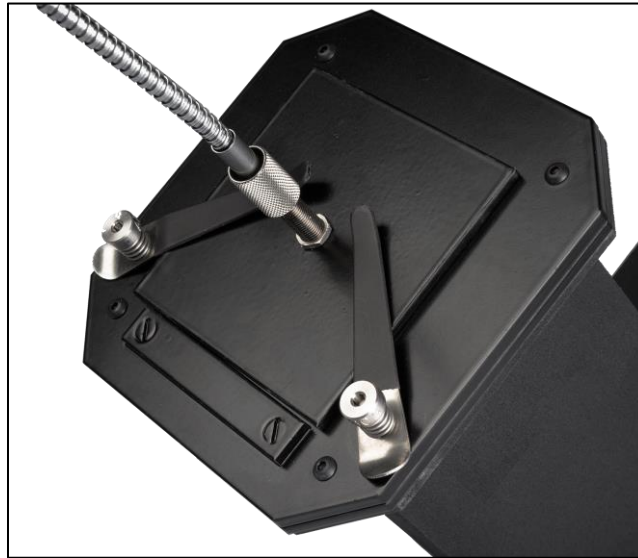
Connected calibration device

Please use caution when working with the spectrometer and fiber, and avoid putting extra pressure on the device. If you have finished your light setting or calibration, you can disconnect the calibration device and stop the measurement in the control software. The spectrometer can also be used for external measurements of other light sources.