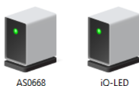
Hardware Manager: active iQ-LED and spectrometer