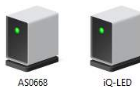
Hardware Manager: active iQ-LED and spectrometer