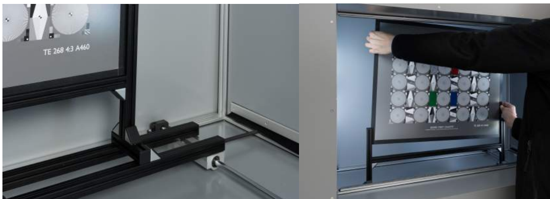
Chart exchange mechanism

The iQ-Chart Box is equipped with a chart holder which can be used for all Image Engineering test charts in size A460. To exchange the test chart use the knob on the right side of the iQ-Chart Box and pull it slightly towards the front. Now you can easily exchange the test chart by lifting it little bit to release it from the chart holder guide rail. Remove the current test chart and put the new testchart in the chart holder – the best way to insert the test chart is to hold it in an upright position above the chart holder guide rail inside the iQ-Chart Box. Drop it carefully in the