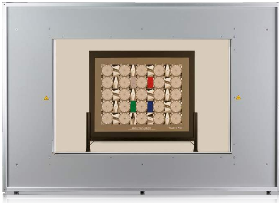
Image Engineering GmbH & Co. KG · Im Gleisdreieck 5 · 50169 Kerpen-Horrem · Germany

T +49 2273 99991-0 · F +49 2273 99991-10 · www.image-engineering.com