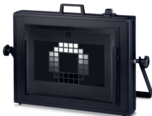
LG4 with OECF test chart TE269

The Controller Areas Network (CAN) system allows up to 99 LG4s to be connected and controlled by the LG software.