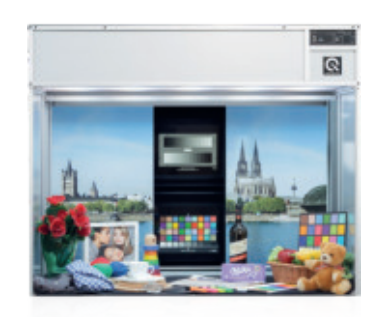
lightSTUDIO-H with HDR option