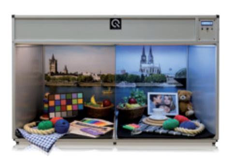
lightSTUDIO-AW Figure: Pre-series model