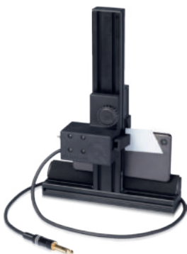
iQ-Defocus with iQ-Mobilemount

The iQ-Defocus is primarily used in conjunction with the LED-Panel or the DTS. Easily attach the device to the iQ-Mobilemount and control via integrated software in the LED-Panel or DTS.