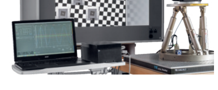
Directions of movement