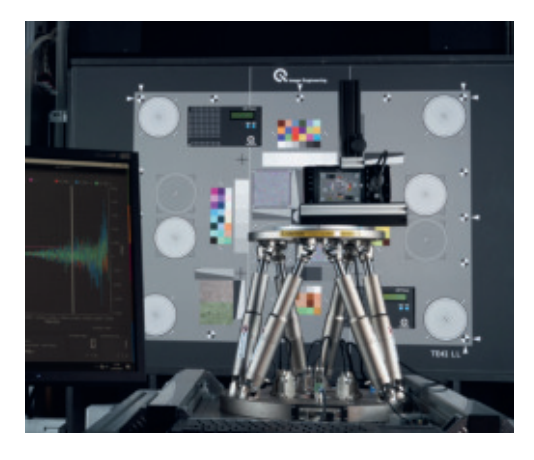
OIS test with the STEVE 6DL and the TE42-LL-Timing