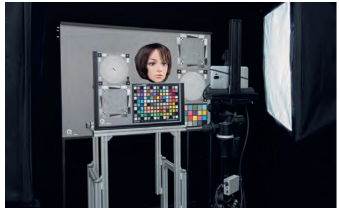
iQ-Selfie Studio test scene